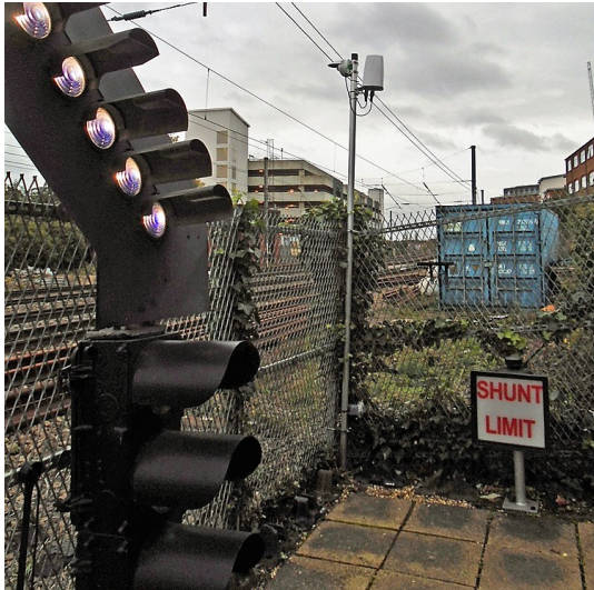
The new RailCam cameras in the south eastern corner of the site as mentioned below by Tony.