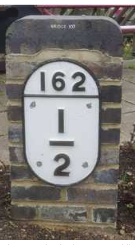
Above: the new Midland lamp post being manoeuvred into position and then ready to receive its lantern top. Like the lamppost by the entrance gate this one originally stood outside the old station building close to Ridgmont Road. The final shot shows the new plinth with the Pig Tor Tunnel (near Buxton) milepost and Bridge 107 coping stone.