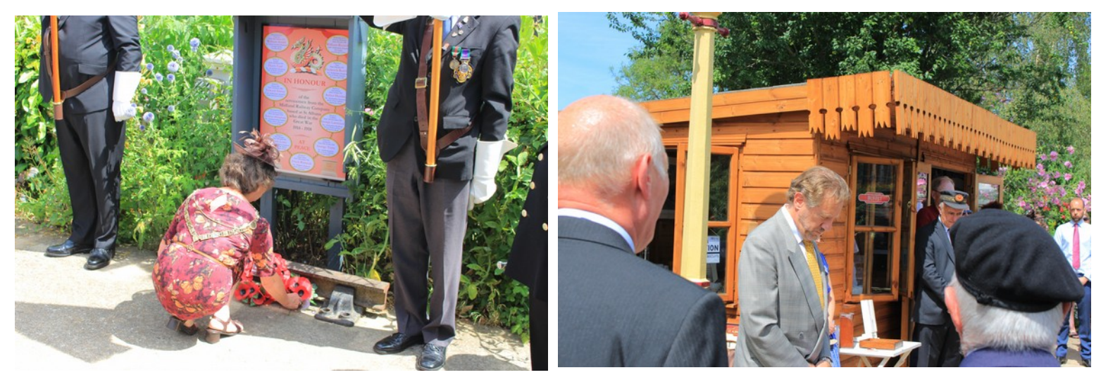
Left: The Mayor lays a wreath in front of the Memorial panel on behalf of the Council. Right: The Lord Lieutenant bows his head after reading the Kohima Epitaph.