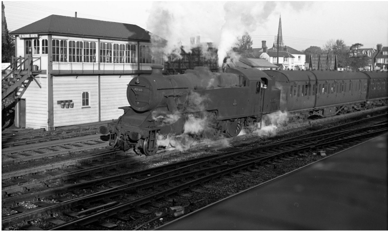
'Nearing the end' On 27 th October 1959 only a few months before steam ended on the local services a very dirty and wheezy 2-6-4 tank 42685 starts the 8.24am to St Pancras and passes St Albans South 'box.