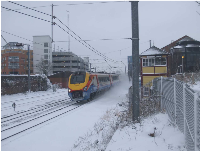
Even on a snowy February day the box still stands out