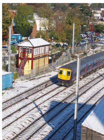
The box seen from the top of the new car park.

The atmospheric photograph on the left that appeared in the Review newspaper last September was taken by local resident David Hawthorn. Amongst other things the picture shows our old friend the three shunting signals or 'dollies'. Howard Green has commented that at one time the signals were moved by BR to sit in between the up and down