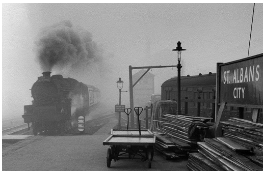
The Palatine express storms past the box bound for Manchester on a foggy November morning in 1959