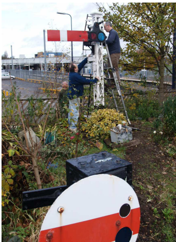
The signal post in the garden now supports a home signal.