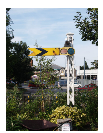
The donated distant signal sited in the garden