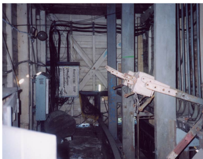
The ground floor weights

'C1863. Midland Railway signal box of three bay type. Timber framed with weatherboarded ground floor, outer bays containing small framed windows. 1 st floor fully glazed with two bays of 3 lights and one bay of 2 lights: small paned sliding casement windows. Hipped slate roof. Wooden flight of steps with plain banisters give access across to first floor side entrance. Iron bracketed balcony to front. This is a good unaltered example of a 3 bay Midland Railway Signal box contemporary with the opening of the main line through to St Pancras.'