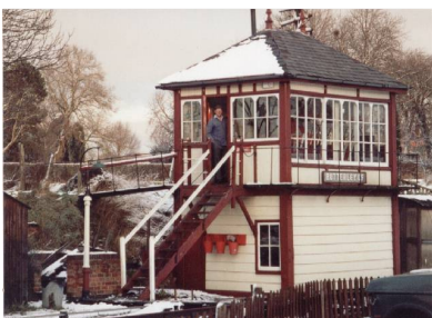
Butterley signal box at the Midland Railway Centre