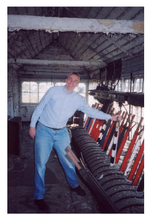
This one places a detonator on the track!