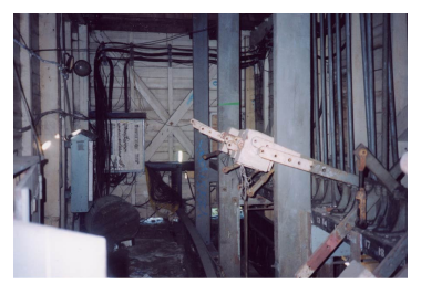
Lots of bits down here

It's not easy becoming a charity! Although we can't see anyone gaining any private benefit from the project, the Charity Commission are taking some convincing. But we'll get there!