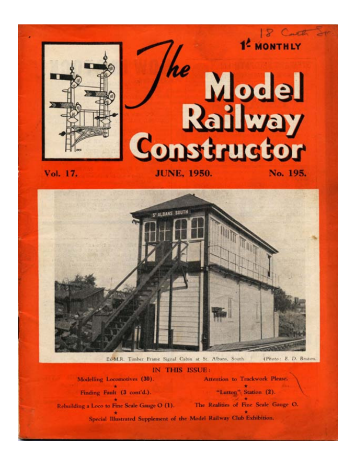
June 1950 - the Star of MRC magazine