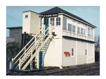
The Box in 1977

'Once open, it will also be used for school visits to demonstrate the dangers of going near the railway. Talks are in progress to use the box as a training room for Network Rail.'