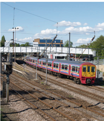
The Thameslink 'candy striped' Class 319 units pass the Box