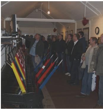
First Capital Connect drivers from Bedford on their visit to the Box in March