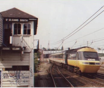
15.05 St Pancras to Sheffield HST hurries past the Box on 15th May 1988.