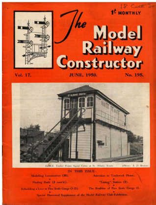
June 1950 - the Star of MRC magazine