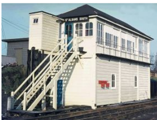
The Box in 1977

“No shaking mops from the windows (there’s 25,000 volts around!)”